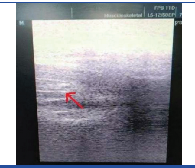
[Table/Fig-3]: Ultrasound image of radiofrequency needle.