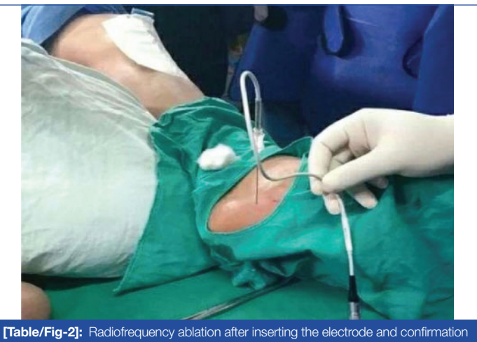
of needle tip.

the nerve, indicated by a tingling sensation. Low-frequency motor stimulation was then performed to check for muscle fasciculation, allowing repositioning of the needle if necessary to avoid damaging motor fibers. Once positioning was confirmed, 0.5 cc of 2% lidocaine was delivered through the probe cannula to anesthetise the skin and soft tissue before ablation. Two cycles of 90 seconds pulsed mode RF ablation were performed, maintaining a constant temperature of 42°C, frequency of 2 Hz, and pulse width of 20 milliseconds. Patients were observed for 30 minutes after the procedure [Table/Fig-2-4].